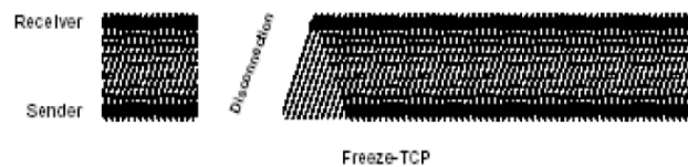
Fig. 3. Increased throughput due to freeze-TCP

In Freeze-TCP, receiver identifies an impending disconnection because of potential handoff, fading signal strength, or any other problem arising due to wireless media and notifies the sender of any impending disconnection by advertising a zero window size (ZWA- zero window advertisement) and prevents the sender from entering into congestion avoidance phase. Upon getting the advertised window as zero, the sender enters the persist mode and freezes all the timers related to the session. And periodically sends the ZWP (Zero Window Probes) until the receiver's window opens up. Since the ZWPs are exponentially backed off, there is a possibility of having a long idle time after the reestablishment of connection. To avoid this, the receiver employs "TR-ACKs" (Triplicate Reconnection ACKs). As soon as the connection is reestablished, the receiver sends 3 copies of the ACK for the last data segment successfully received prior to disconnection to enable the fast transmit. (Fig. 3)