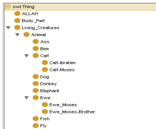
Fig. 1. Part of the sample ontology

For extensibility purposed, we have focused of creating more classes so that in future, more characteristics regarding other knowledge subjects like science, Hadith etc can easily be made part of it. The part of class hierarchy showing classes is shown. (Fig. 1-Fig. 4)